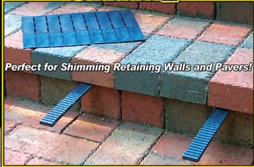
Perfect for Shimming Retaining Walls and Pavers!