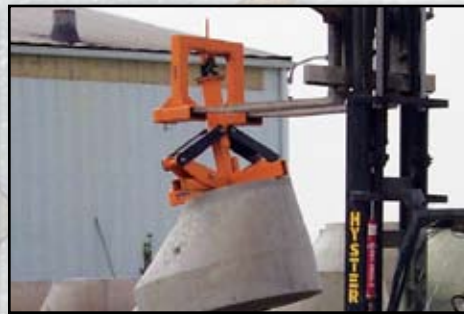
KIG-1 Cone Clamp Weight Capacity: 4,400 lbs Cone Top ID: 24" - 30"