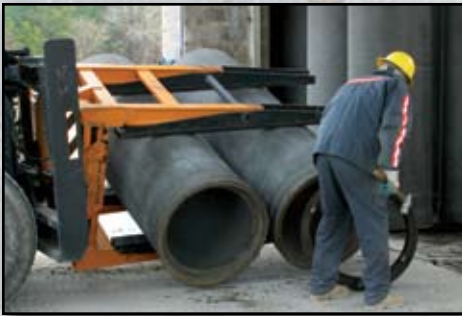
WG-R Rotating Pipe Clamp Capacity: 6,600 lbs or 9,900 lbs Typical Pipe ID: 12" - 48"