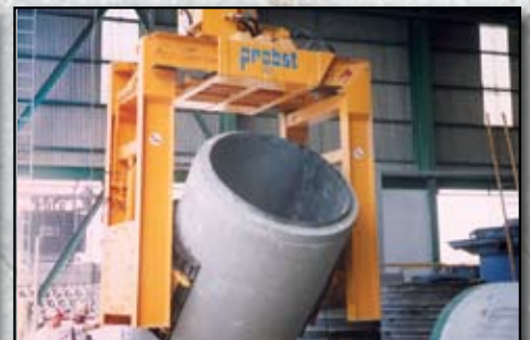
PWG-Series Pipe Tip-Out Clamp Weight Capacity: 45,000 lbs + Pipe Sizes: 12" - 96"