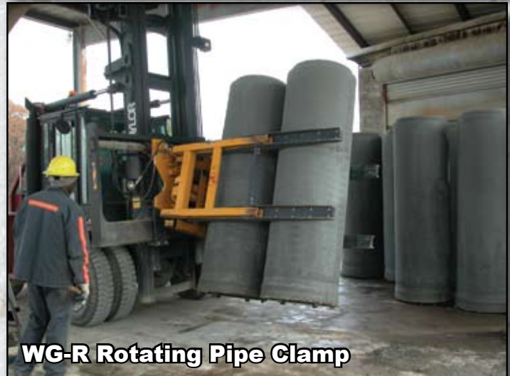
WG-R Rotating Pipe Clamp