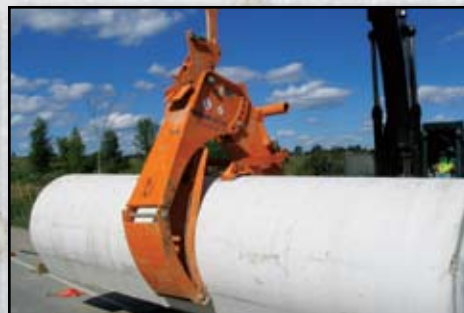
RG-Series Pipe Installation Clamp Weight Capacity: up to 26,000 lbs Pipe Sizes: up to 98" OD