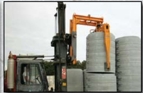
RKZ Hydraulic Manhole Clamp Typical Capacity: 7,500 lbs Typical ID: 24" - 60"