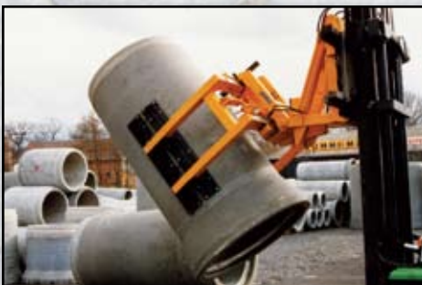
UG-Series Pipe Tip-Out Clamp Weight Capacity: up to 14,000 lbs Pipe Sizes: 12" - 60"