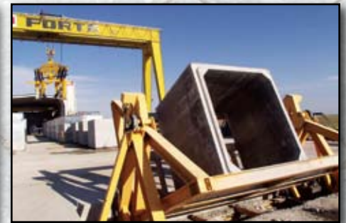
Pipe Clamp/Hyd. Table RK/KT-Series Weight Capacities: 55,000 lbs + Product Sizes: 12 ft +