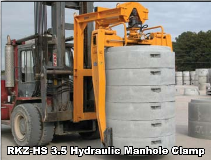
RKZ-HS 3.5 Hydraulic Manhole Clamp