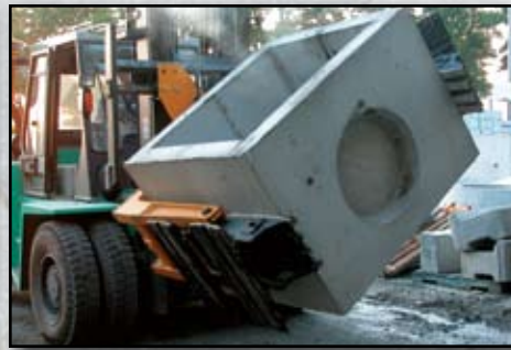
WG-Series Hyd. Rotating Clamp Typical Capacity: 10,000 lbs Typical OD: 32" - 72" Other capacities available.