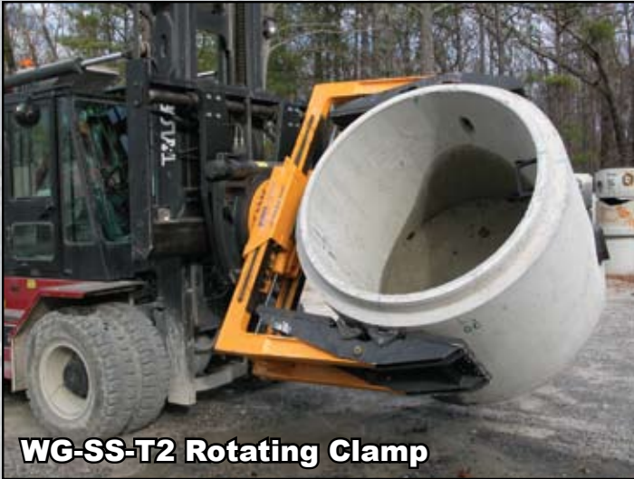
WG-SS-T2 Rotating Clamp

Exceeds German Quality & Safety Standards DIN, ISO & EC 98/37EG