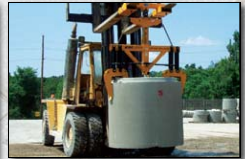
RK1-USA/3.2 Manhole Clamp Weight Capacity: 7,000 lbs Manhole ID: 36" - 60"