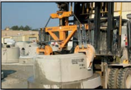
RK1-USA/5.0 Manhole Clamp Weight Capacity: 11,000 lbs Manhole ID: 36" - 60"