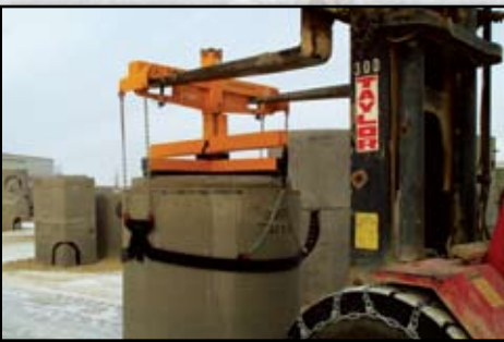
MBG Mechanical Manhole Band Grab Weight Capacity: 6,600 lbs Typical Manhole/Cone OD: 58"