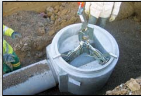
Manhole Installation Clamp SVZ-uni For bases, risers & cones Weight Capacity: 5,500 lbs Manhole ID: 24" - 60"