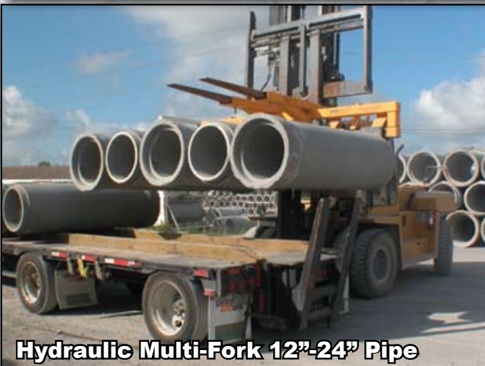
Hydraulic Multi-Fork 12"-24" Pipe