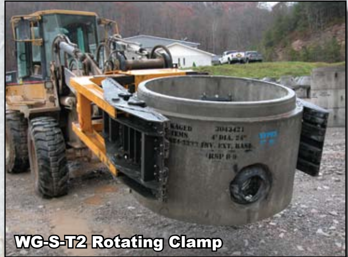
WG-S-T2 Rotating Clamp