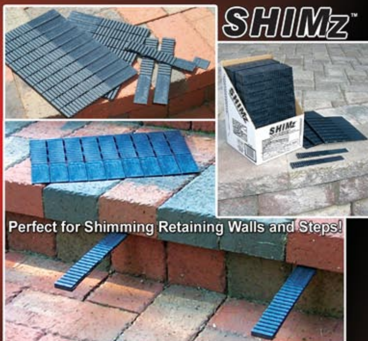
Perfect for Shimming Retaining Walls and Steps!

For MSDS and Application Guides - Visit our Web Site: WWW.PAVE TECH.COM or Call: 800-728-3832