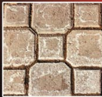
Winter Salt Buildup