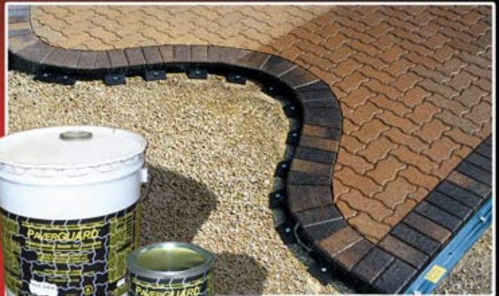
PAVERGUARD before and after